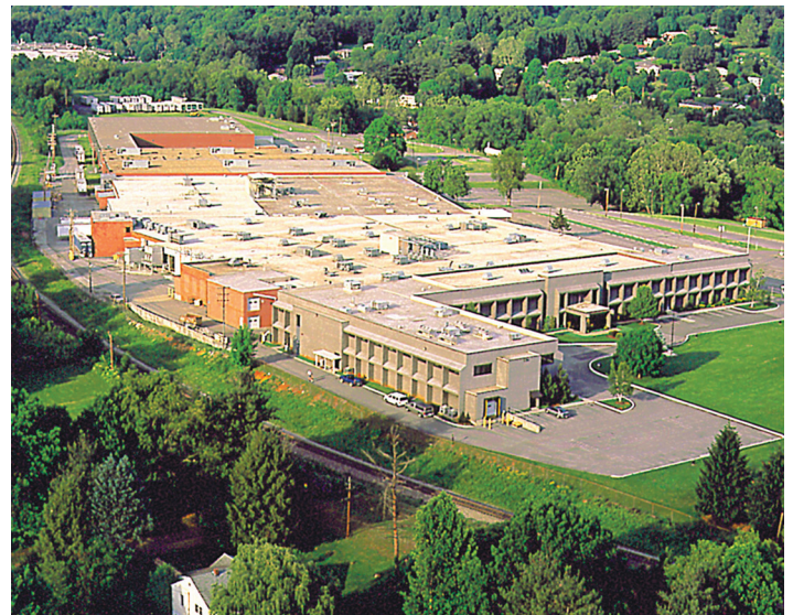
MANUFACTURING PLANT | BRISTOL, VA