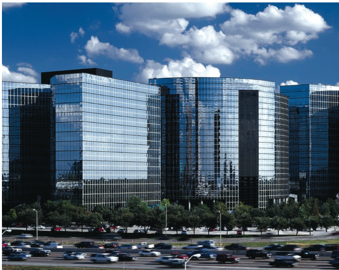
CORPORATE HEADQUARTERS | DALLAS, TX